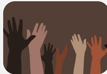
Addressing Racial Inequality, Serving Underserved Communities