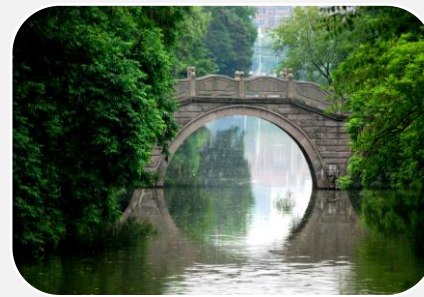
Economic Recovery & Infrastructure